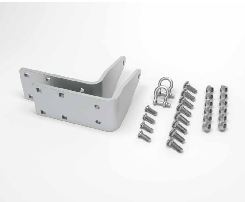
SBB 2" AND SBB 2" ADJUSTABLE OUTSIDE HOOK-UP ADAPTOR (# 149705)