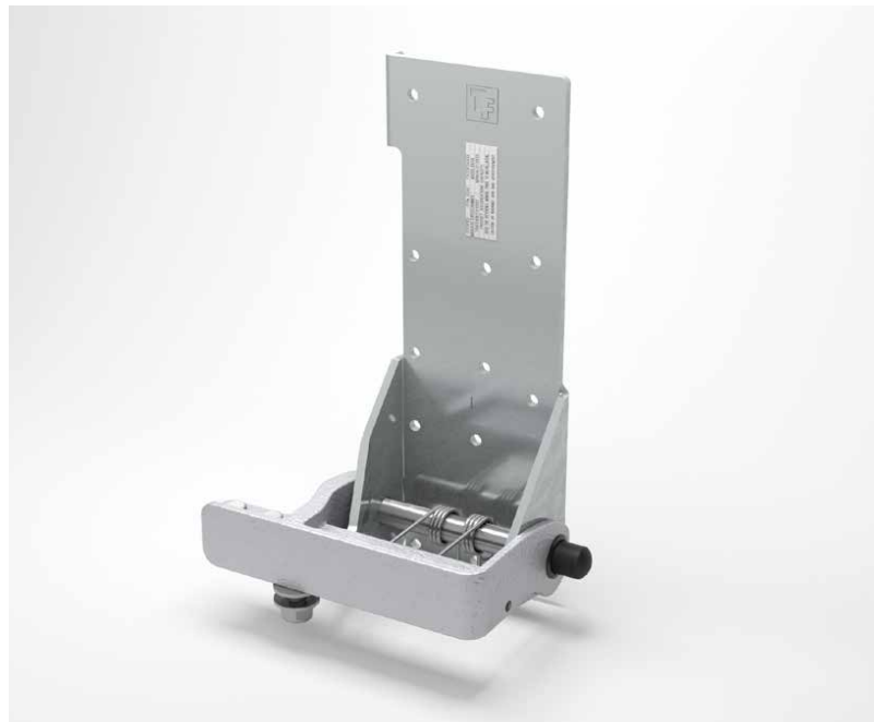
SBB 3" LOW TENSION (# 172440 / LEFT AND # 172443 / RIGHT)

TF SBB ARE DESIGNED TO REDUCE THE RISK OF A DOOR FROM FALLING IN THE EVENT OF SECTIONAL DOOR CABLE BREAKAGE.