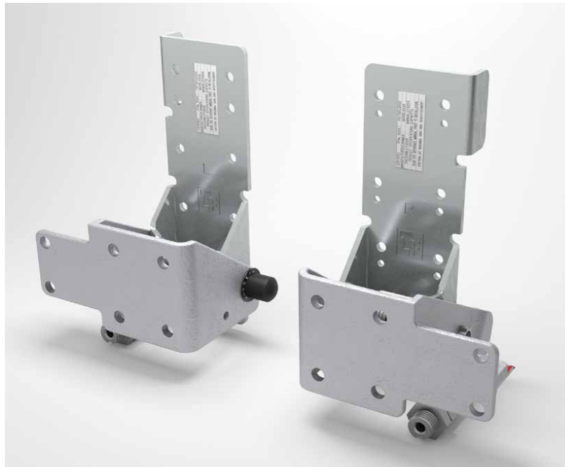
SBB 2" ADJUSTABLE (# 155180 / PAIR)