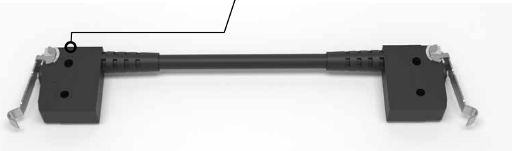
LIMIT SWITCH (# 203470)

All models have been laboratory tested and the 2" (50 mm) models are TÜV certified.