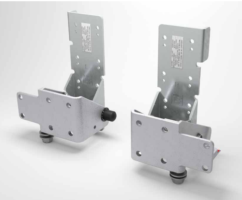
SBB 2" (# 149185 / PAIR)